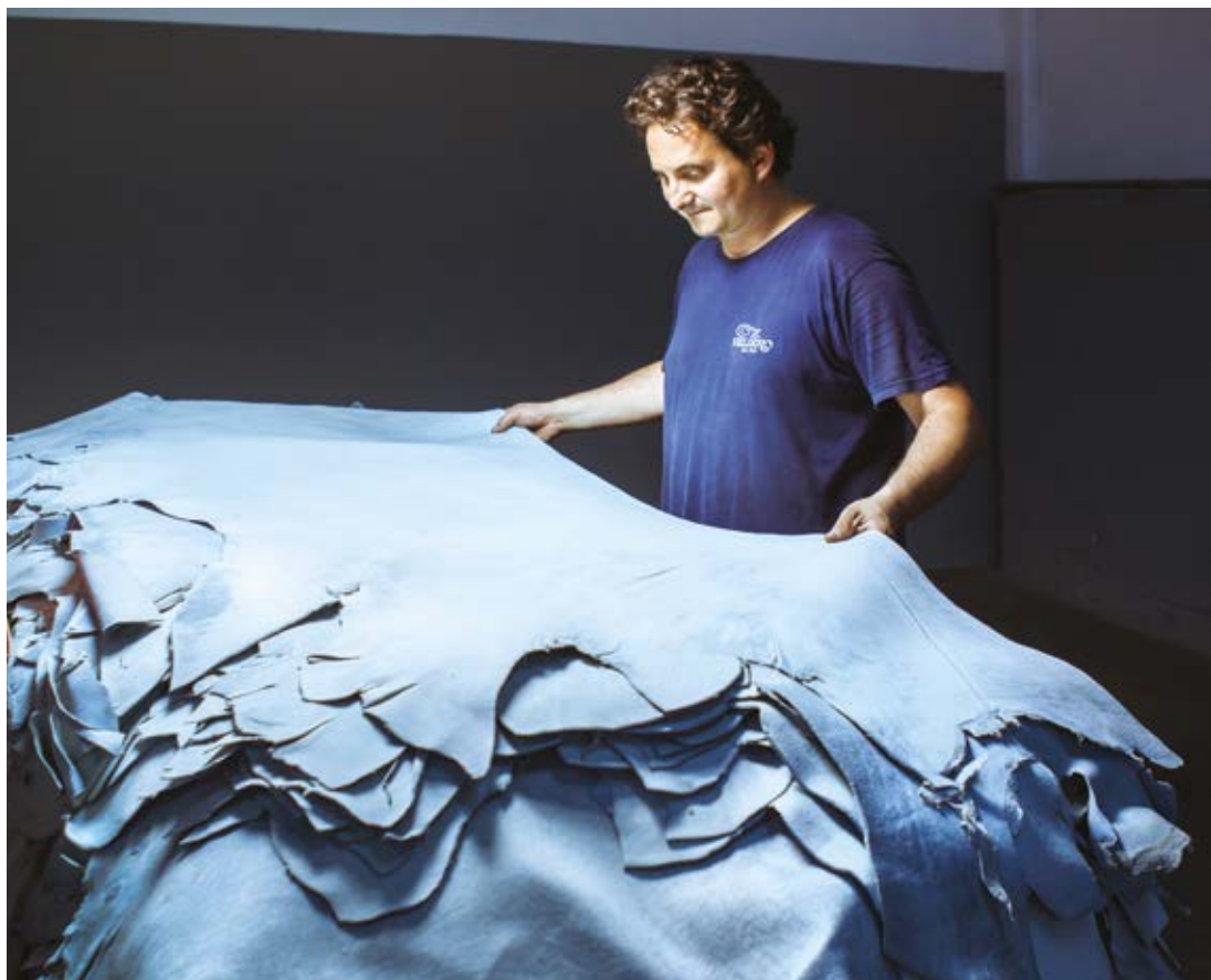
The selection in the depot

depot (90 days) according to the canonical rules of storage in order to get the maximum result by the chrome-tanning resting process; we ensure the quality of the preparatory process which is the only one in Italy to be computerized (including the barrel system and the administration of products during the liming, tanning, re-tanning and dyeing phases). Our "Hyper-protein Line" of chrome-tanned skins confers to the final product an extraordinary rubberiness and fullness even on very low thicknesses, on both half calves and on the young calf skins of the apparel line. Raw skins come from selected geographical areas in the heart of Western Europe. When all these elements combine is it possible to produce leather of the highest quality that meets the requirements of even the most demanding client.