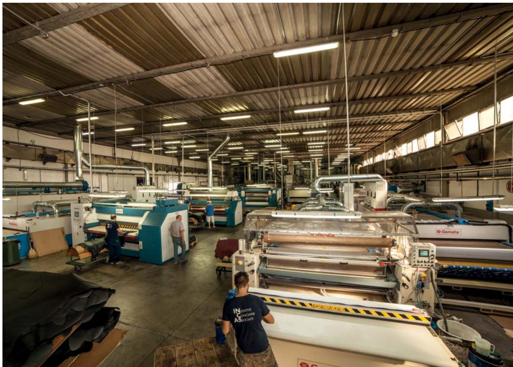
The new finishing department.